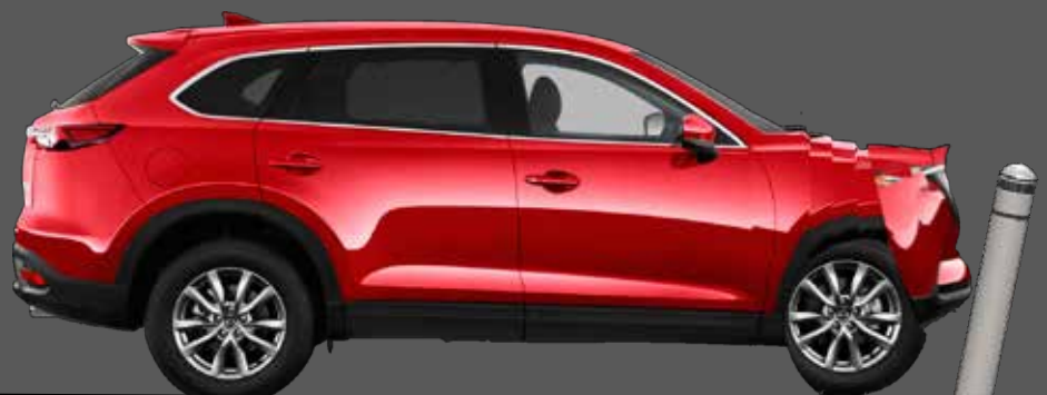
Heavy vehicle — both crash zones crumple