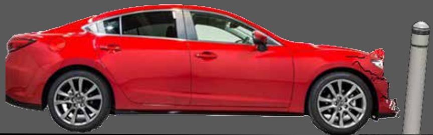
Light vehicle — soft crash zones crumples