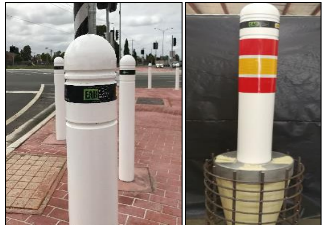
Figure 1. Energy Absorbing Bollard

The Energy Absorbing Bollard should be designed, installed and maintained in accordance with the following VicRoads conditions for use.