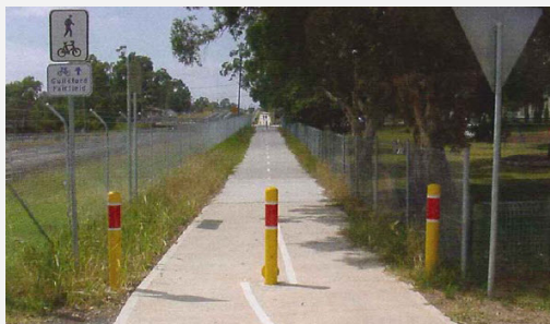
Steel Bollard: Access restriction, containment unknown, impact behaviour unknown.