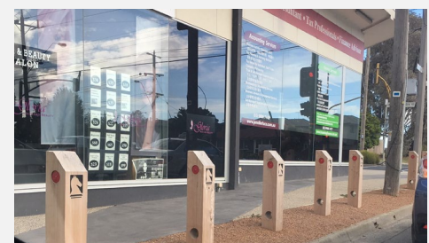
Timber Bollard: Access restriction, unknown containment, impact behaviour unknown- deemed frangible in one direction.

Hostile Vehicle Management (HVM) uses a blend of traffic calming measures to slow down hostile vehicles and vehicle security Barriers (VSB) to stop those hostile vehicles progressing further. VSBs provide the hard stop for penetrative vehicle attack, they are