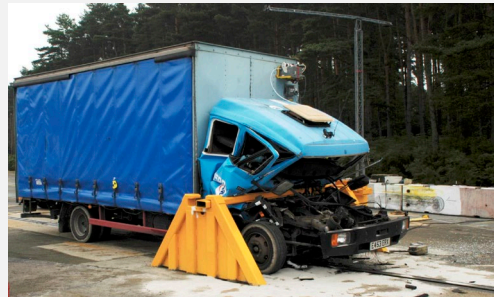
VSB Gate: Narrow impact point will focus energy into the occupant compartment causing undue risk to errant vehicles. This device should be located such that it cannot be impacted by errant vehicles.