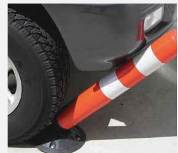
Plastic Bollard: Flexible design, often used for delineation.

Bollards used for delineation, often made from plastic, must be designed such that they do not create an undue hazard for the vehicle occupants or nearby traffic when impacted. While crash testing would provide a better understanding of impact behaviour, lightweight and flexible materials (e.g. plastic) are generally considered satisfactory.