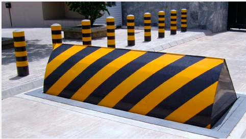
VSB Bollard: Similar severity to other roadside hazards, does not present undue risk to occupants or others, must be located within a low speed environment.

Like protection bollards, it is acknowledged that many vehicles can manage energy transfer during a low-speed impact, assuming the device does not present an undue risk during impact such as the potential to penetrate the vehicle or cause harm to others. As such, it is critical that VSBs are designed (shaped), positioned and orientated with an errant vehicle impact in mind. This includes smooth surfaces, rounded edges and a large contact surface that will distribute energy. Components that are likely to leave the system during impact or may spear a vehicle must be avoided. Physical crash testing is the preferred method of testing.